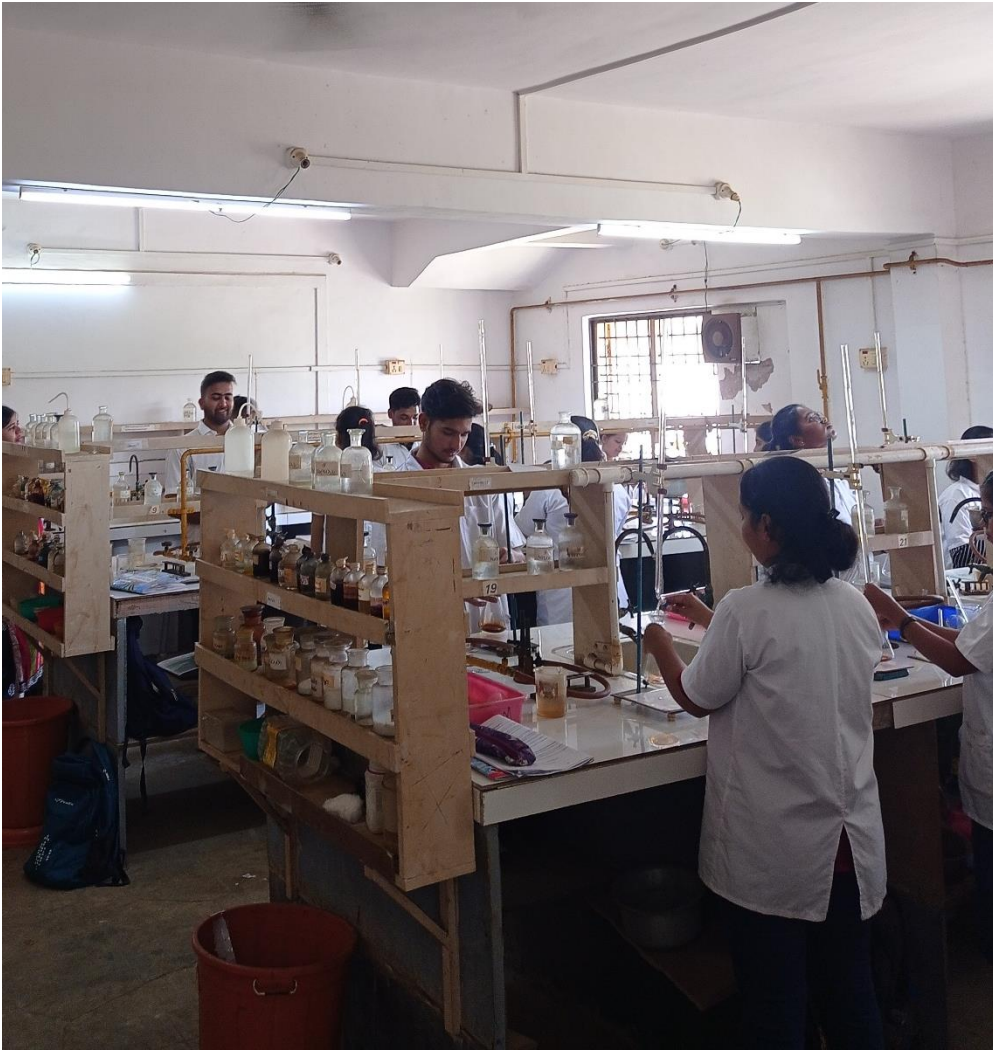
STUDENTS PERFORMING PRACTICAL'S